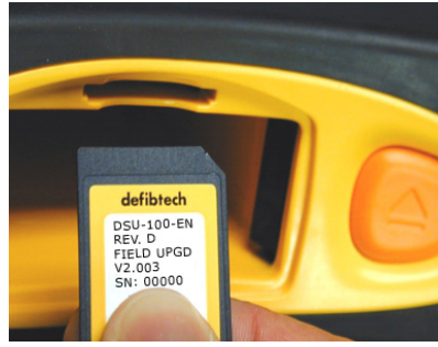
Figure 2: Insert the DSU-100 Software Upgrade Data Card as shown.