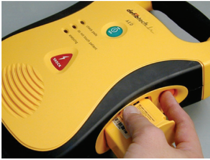
Figure 1: Press orange release button to eject the battery pack.