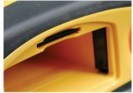
Figure 3: Push the card in until it clicks into place flush with surface as shown.